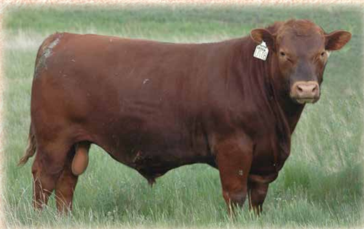
Red XO Crowfoot 817U - Sire of Red Crowfoot 187X

187X is a calving ease sire who is moderate, deep bodied, deep ribbed and easy fleshing. The average birth weight of his sons is 83 lbs. They are deep, wide and muscular. Calving ease with performance.