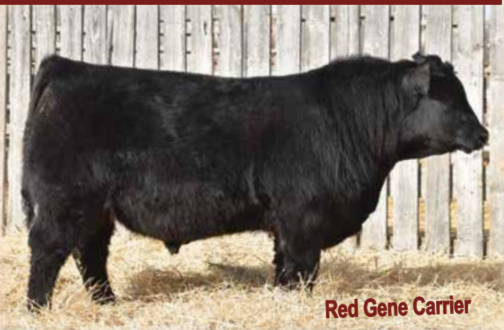
Red Gene Carrier

This bull is a deep, soggy performance bull. His actual WW on October 22 was 701 lbs. Out of a beautiful female who is a daughter of our infamous 6F cow. Here is a bull that will give good performance and you will want to keep his daughters. Unfortunately he couldn't be registered but is straight Angus.