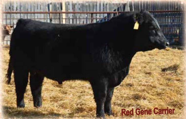
Red Gene Carrier

A Black Hitch son with good performance.