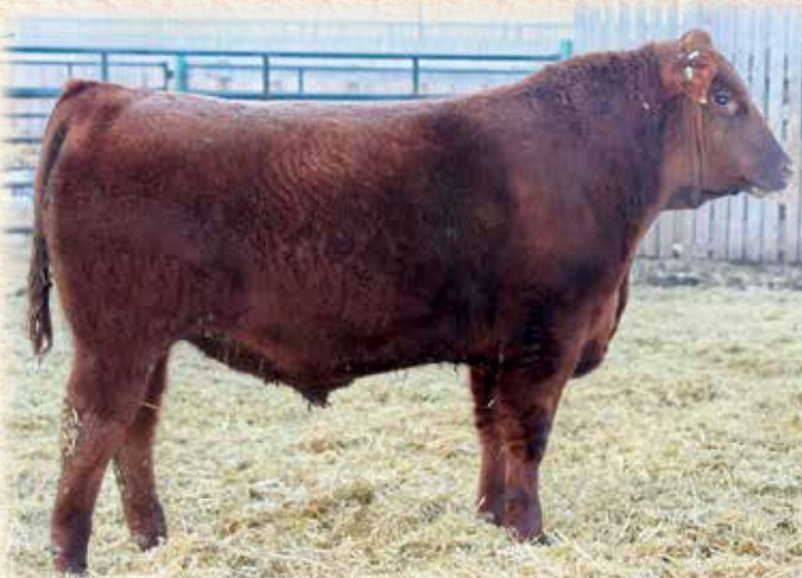
Red TR Prairie Fire 500W - Sire of Red SVR Kodiak 213Z

213Z is a long bodied bull with tremendous depth and good performance. We used him to get the Kodiak 5R genetics in our red cows. Birth weight average on his sons is 84 lbs.