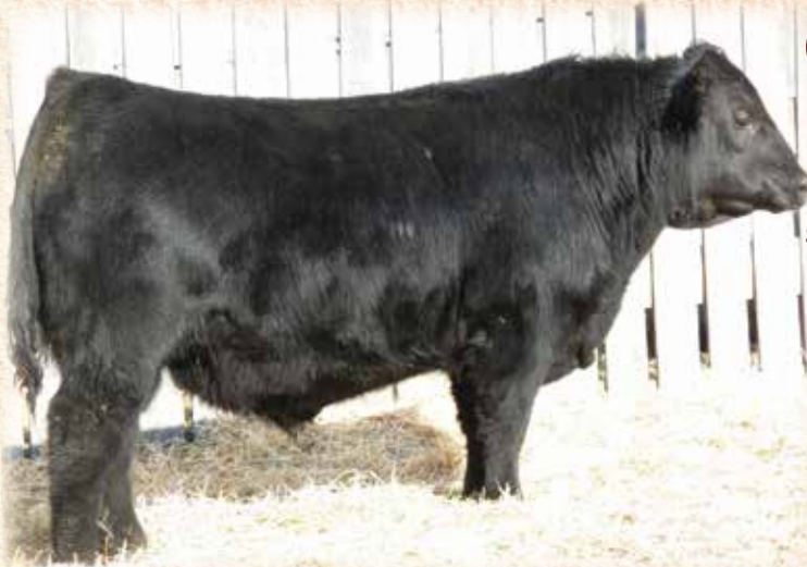
SVR Network 335U - Grandsire of Net Worth 406Z