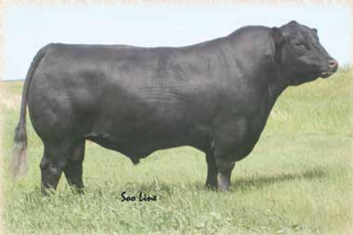
HF Kodiak 5R - Sire of Geis Kodiak 115'09

We selected 115W from the Geis Angus bull pen to infuse the Kodiak 5R genetics into our herd. He sires calving ease, performance and eye appeal. The average birth weight on his sons is 75 lbs.