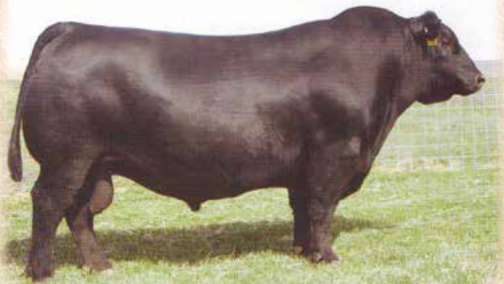
SAV Net Worth 4200 - Grandsire of SVR Dominate 478Y

478Y is a deep bodied, stout made bull with a real good foot and lots of heel. His dam 341T was Keaton's first show heifer and she is a very complete, beautiful Angus cow.