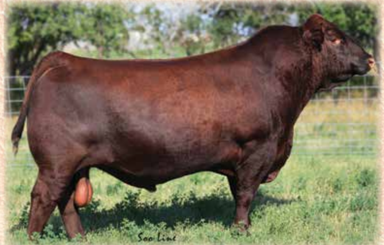
Red Cockburn Ribeye 308U - Full brother to Red Cockburn Ribeye 553X

159Z is a big volume, moderate birth weight bull we used on our heifers. He's got lots of performance and thickness for a calving ease sire. His dam is a complete cow with perfect feet and udder. Birth weight average on his sons is 74 lbs.